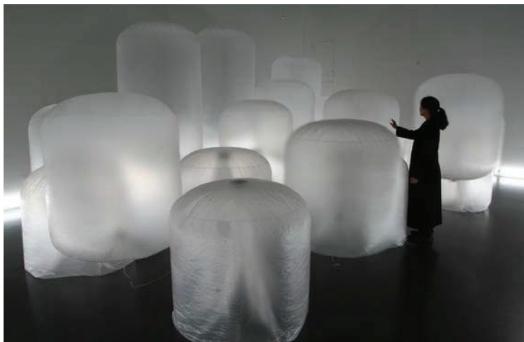
Untitled 2009. Polyethylene film, Fan, etc. 400 x 660 x 960 cm (installation)