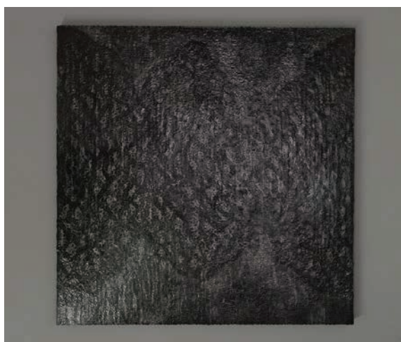
exchange of surface GOoP#2 2013. Adhesive, graphite, Panel. 91 x 91 x 3 cm