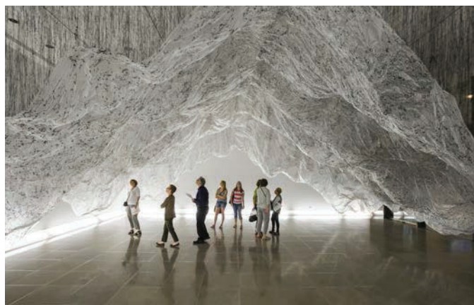
reverse of volume RG 2012. Rice Gallery, Houston, TX, USA

Many more solo and group exhibitions, and residency programs.