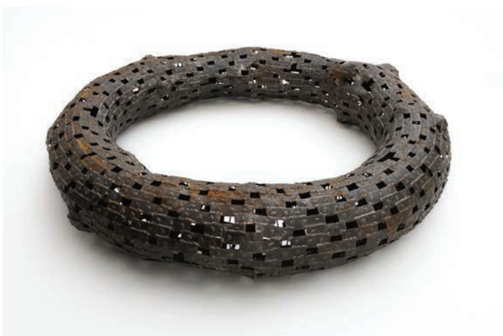
Gawa 2 2002. Steel. 120 x 120 x 50 cm.